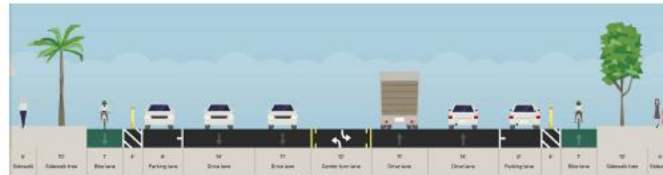
TYPICAL SECTION NOT TO SCALE

ATTENTION All utilities shown on this plan are based on available records. It shall be the sole responsibility of the contractor to verify all existing utilities by contacting utility agencies and to avoid damaging existing utilities during excavation. FOR UNDERGROUND SERVICE ALERT CALL: 1-800-227-2800