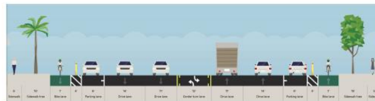
TYPICAL SECTION NOT TO SCALE

ATTENTION All utilities shown on this plan are based on available records. It shall be the sole responsibility of the contractor to verify all existing utilities by contacting utility agencies and to avoid damaging existing utilities during excavation. FOR UNDERGROUND SERVICE ALERT CALL: 1-800-227-2600